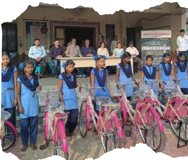
MODEL VILLAGE IN PALGHAR