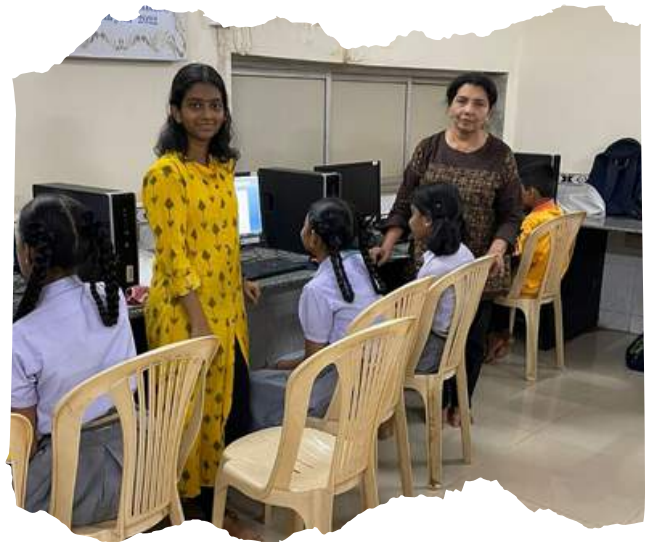
YUSUF MEHERALLY PROJECT