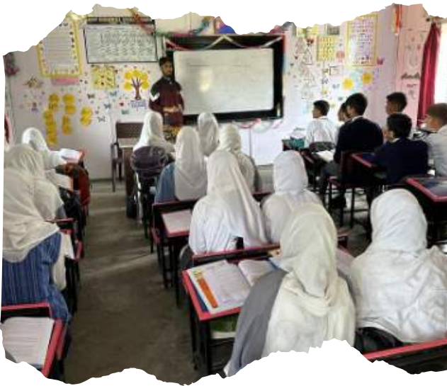
NATIONAL INTEGRATION PROJECT